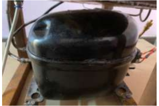
Figure 2.3.5: Compressor

The screw compressor sweeps a volume through two rotors that are meshed together. As the rotors turn inside the closely fitted casing, the space becomes sealed and the gas is compressed. Maintenance, adequate lubrication, cooling and sealing between the working parts is very important. Screw compressors do not have clearance volume, and there is no loss of volumetric efficiency from re-expansion, as in a piston machine. Leakage of refrigerant back to the suction via in-built clearances is a main cause of reduced volumetric efficiency.